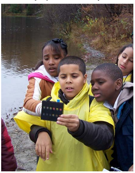
Sixth-grade students determine the acidity of pond water by adding an indicator dve and comparing the color of the sample to a palette of colors.

the South Bronx and many are from degree in biology and three are in setled to a free lunch at school and the research or learn to do so, including vast majority of the students' parents the Summer Science Outreach Pro-