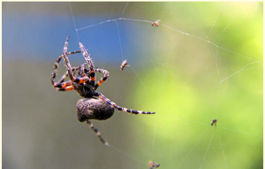
A female orb weaver spider ( Araneus sp.).