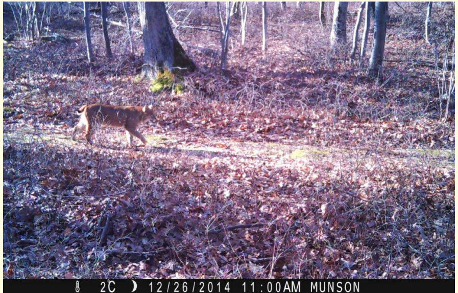
Bobcat caught on motion sensor camera.