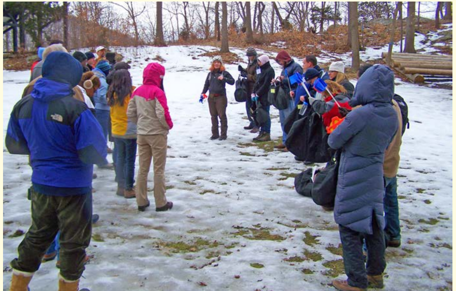
A teacher training workshop in Black Rock Forest.